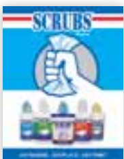
SCRUBS® Brand Wipes Lit # LI120